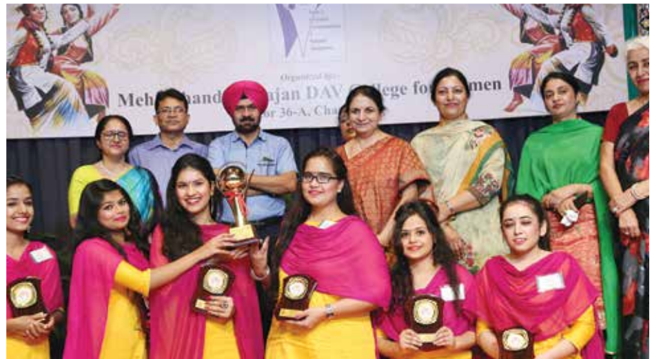
Mehar Chand Mahajan DAV College for Women Sector 36-A, Chandigarh