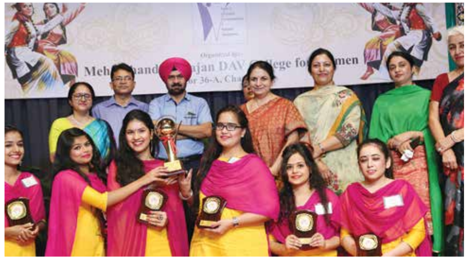
Mehar Chand Mahajan DAV College for Women Sector 36-A, Chandigarh