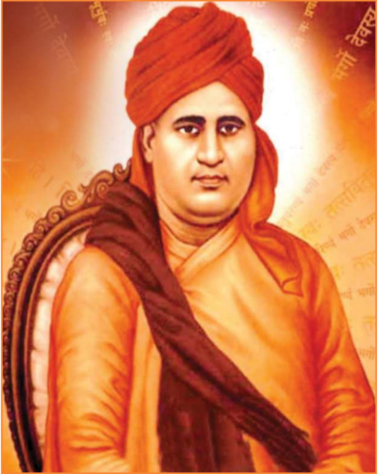
MAHARISHI SWAMI DAYANANDA SARASWATI