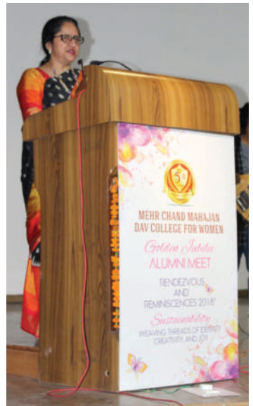
Theme for the Alumni Meet (2018-19)

"Sustainability- Weaving the threads of Creativity, Identity, and Joy"