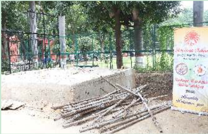
Water Boosting System