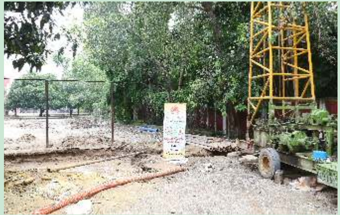
Rain Water Harvesting System