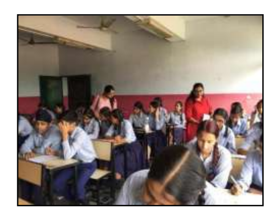
Striving towards Open Defecation Free society