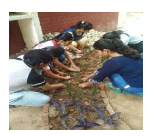
Plantation drive held under the aegis of NSS unit and Botany Department of the college, as part of Swachhta Pakhwada.