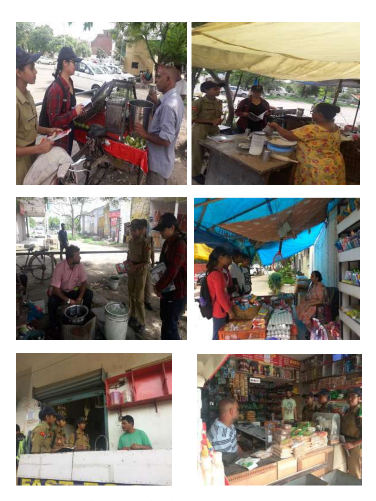
Cadets interacting with the shopkeepers and vendors