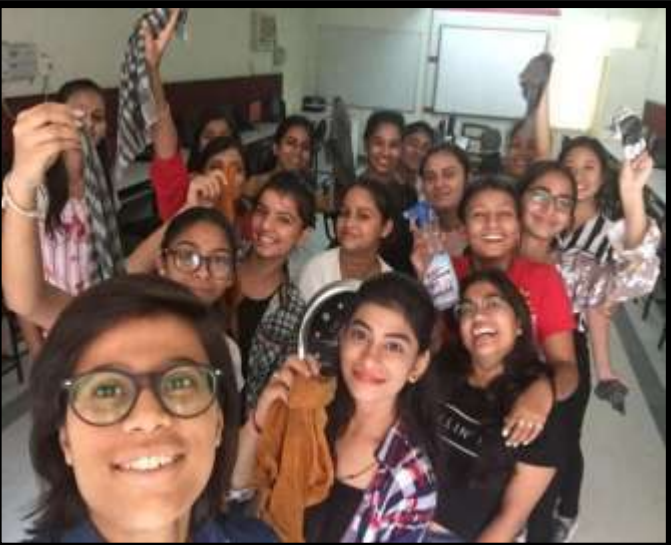
'Swachhta Activity' in progress