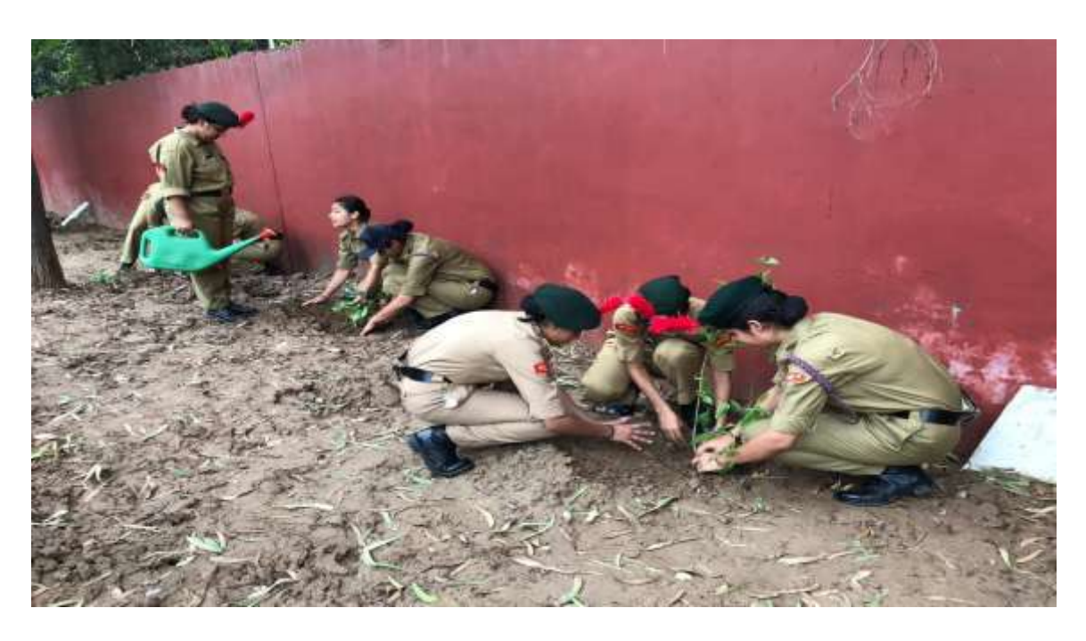
Tree Plantation Drive in Butrela Village

The NCC Army Wing of the college conducted a tree plantation drive in view of 'World Nature Conservation Day' on 27<sup>th</sup> July 2019. The program aimed to create awareness among the youth about the importance of conserving the environment.