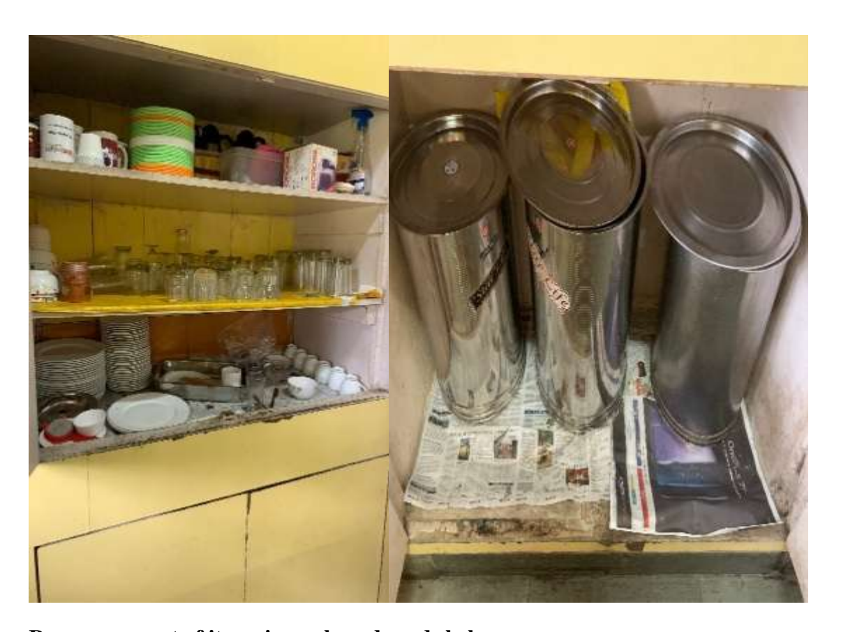
Rearrangement of items in cupboards and shelves

Large scale management of inspections and feedback.