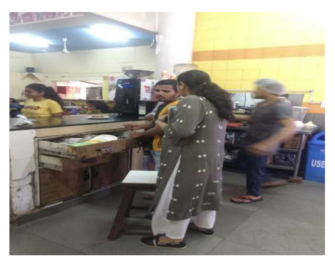
Team member discussing the observations with canteen personnel