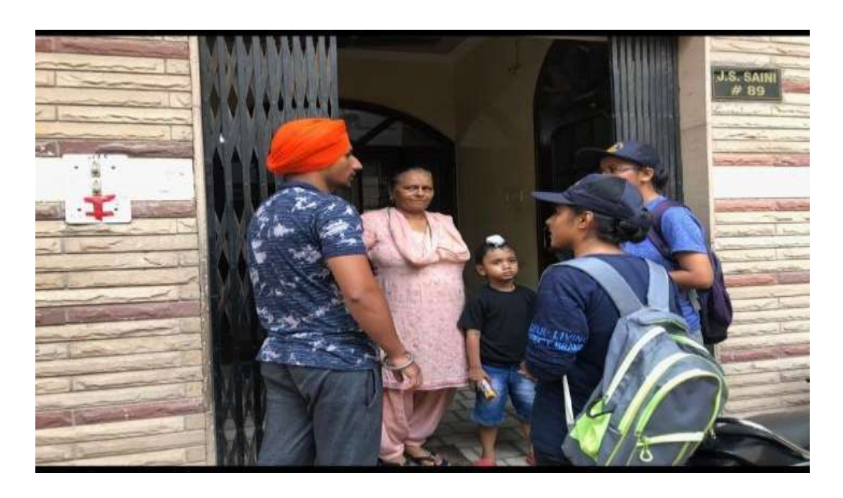
Cadets visiting homes and interacting with the residents