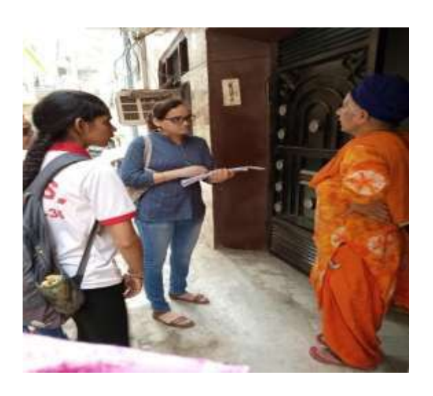
Awareness campaign on 'Plastic Free India' at Kajheri

Notes: The survey contained 9 questions which also required the volunteers to check the condition of the lavatories and observe as to how the villagers were maintaining their respective lavatories and if they were actually providing accurate data.