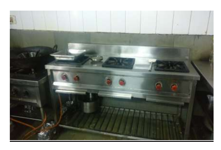
Cleaning of Cooking Area was done