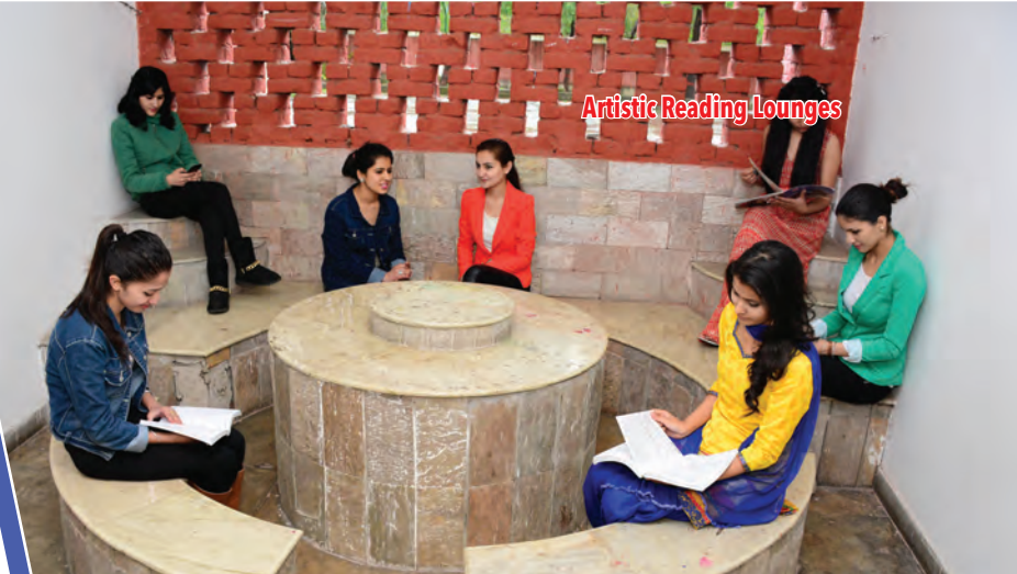
Artistic Reading Lounges