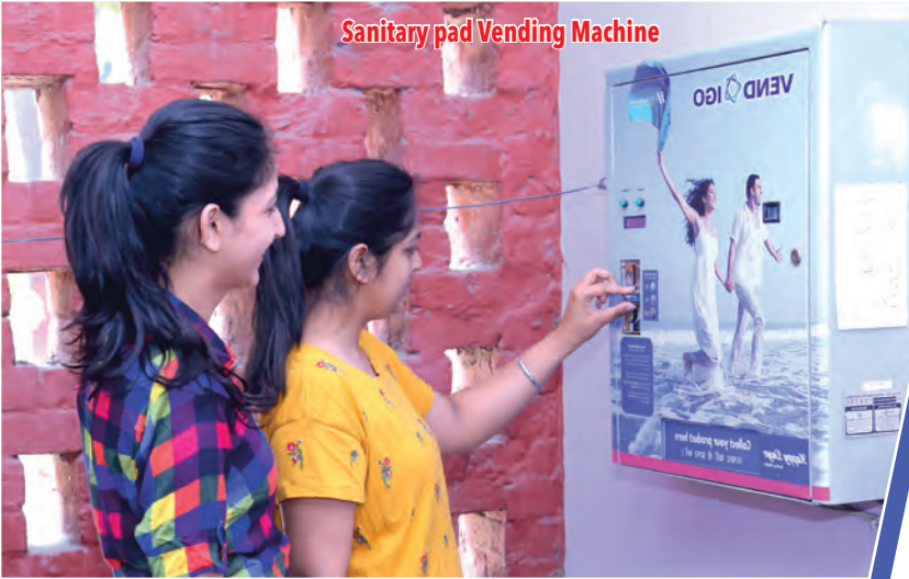
Sanitary pad Vending Machine