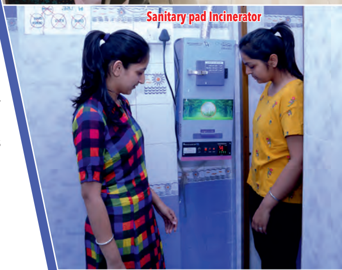
Sanitary pad Incinerator