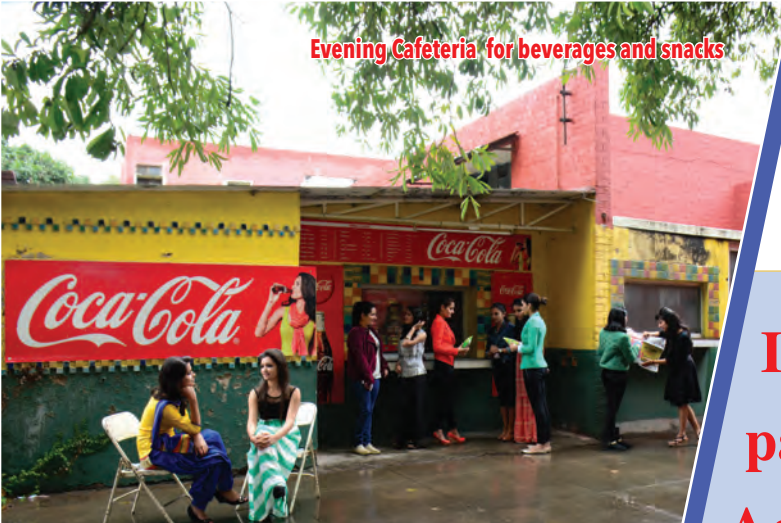
Evening Cafeteria for beverages and snacks