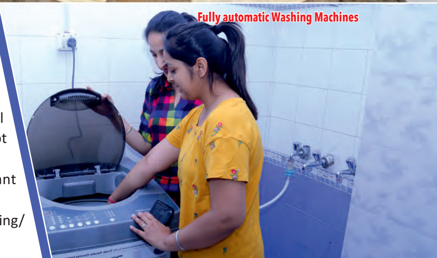
Fully automatic Washing Machines