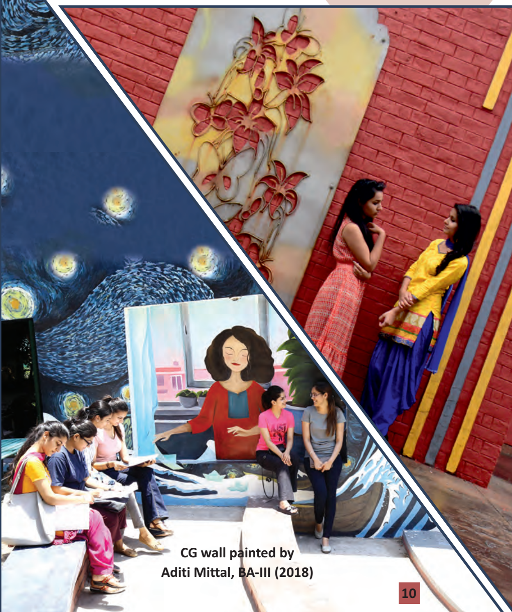
CG wall painted by Aditi Mittal, BA-III (2018)