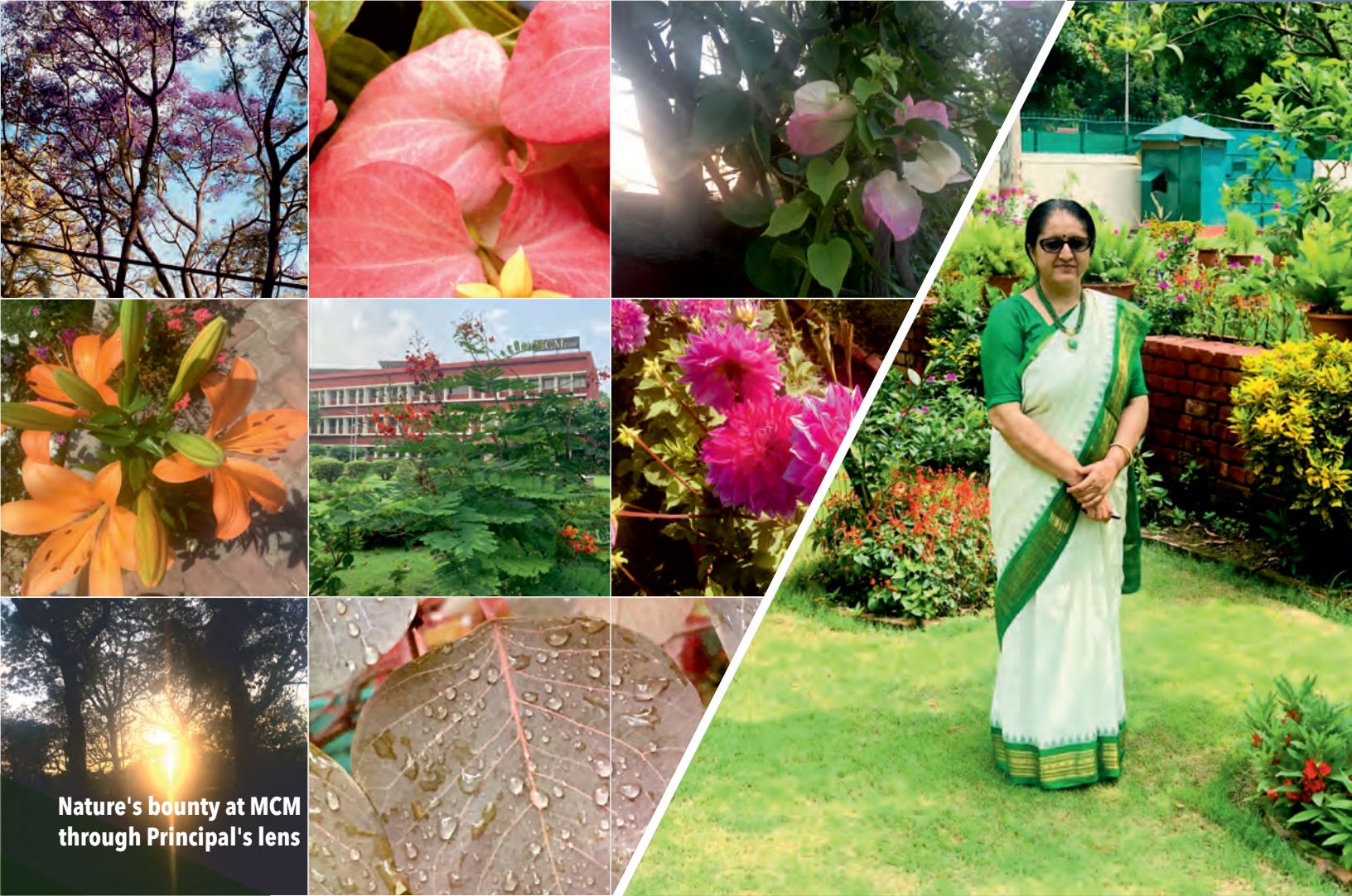
Nature's bounty at MCM through Principal's lens