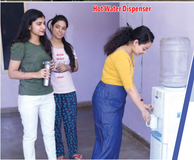
Hot Water Dispenser