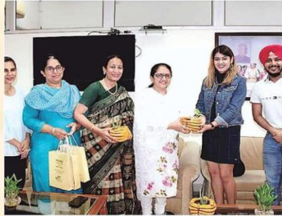
DP CORRESPONDENT Chandigarh

Under the aegis of the Placement Cell of MCM DAV College for Women, Tommy Hilfinger and Calvin Klein during a recruitment drive at the campus on Monday. The premium designer lifestyle group contacted the drive to select stu-