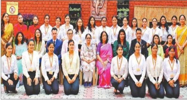
चंडीगढ़ के एमसीएम कॉलेज सेक्टर-36 में ओरिएंटेशन सेशन के दौरान मौजूद स्टूडेंट्स और टीचर्स। अमर उजाला