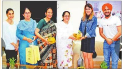
एमसीएम डीएवी कॉलेज में प्लेसमेंट ड्राइव के बाद विद्यार्थियों का सम्मान किया गया।