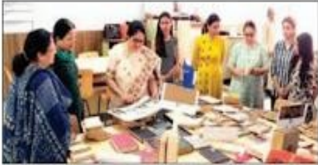
CHANDIGARH, OCT 18

Continuing the 150th birth anniversary celebrations of Mahatma Gandhi, the Library Committee of Mehr Chand Mahajan DAV College for Women organized an exhibition of books on Gandhiji. The book lovers were in for literary treat as over 200 books in three languages i.e. English, Hindi and Punjabi, depicting various facets of the life of Gandhiji, his philosophy and ideology, and contribution in nation building, were exhibited on this occasion.