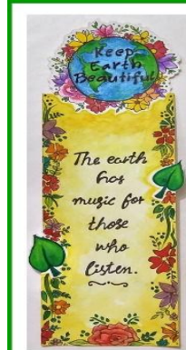
CONSOLATION Kashish DEV SAMAJ COLLEGE FOR WOMEN-45 B CHANDIGARH