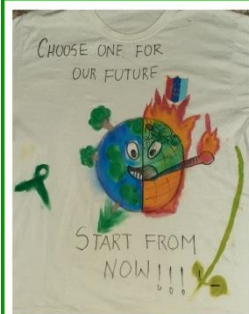
CONSOLATION SEJAL ARORA MEHR CHAND MAHAJAN DAY COLLEGE FOR WOMEN-36, CHANDIGARH