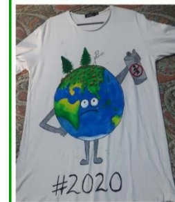
CONSOLATION RHYTHM BANQA MEHR CHAND MAHAJAN DAY COLLEGE FOR WOMEN-36, CHANDIGARH