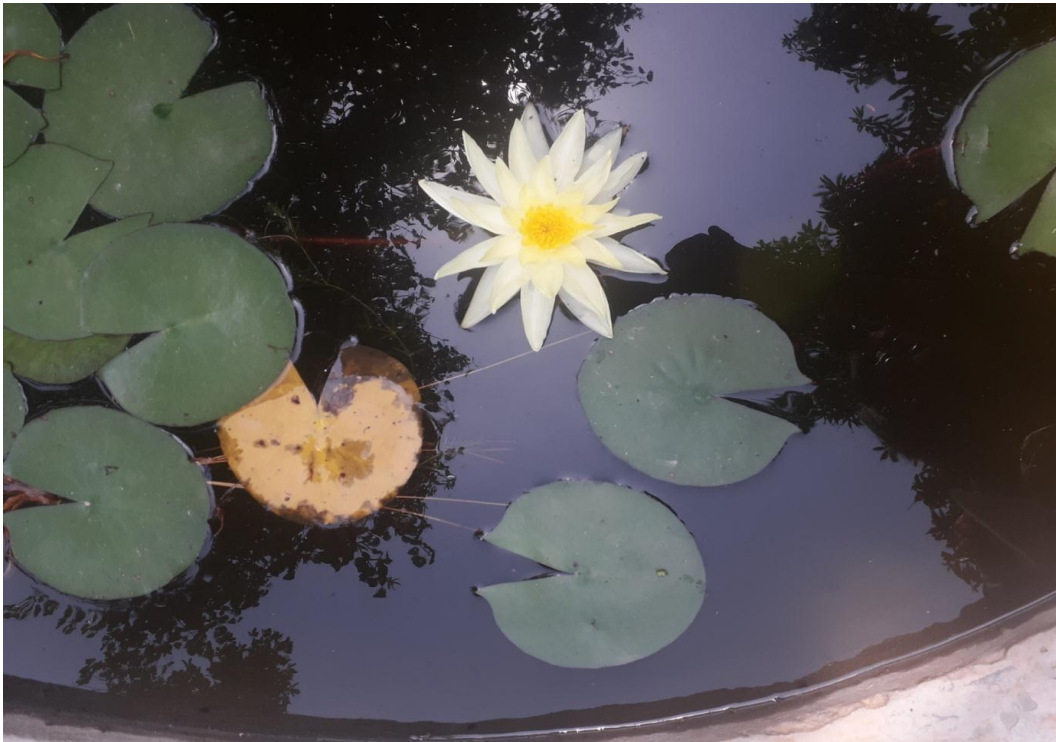
Lotus in Botanical Garden