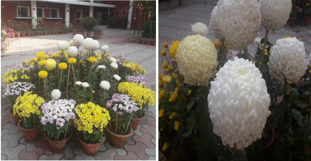
Varieties of Chrysanthemum