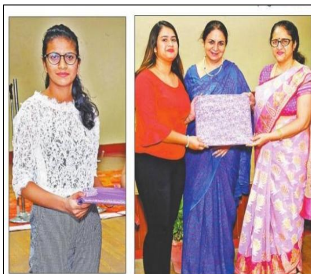
एमसीएम कॉलेज सेक्टर-36 की संगीत प्रतियोगिता की विजेता।