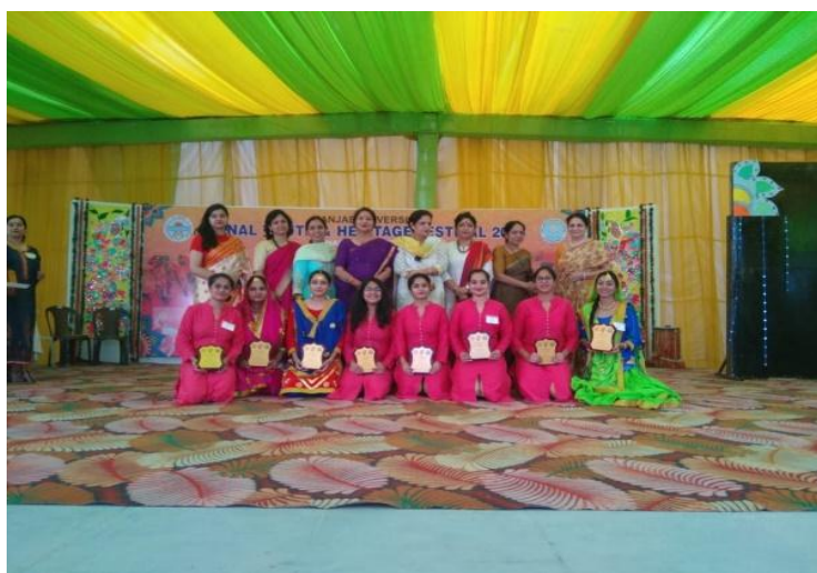
Indian Orchestra receiving 1 st Prize.