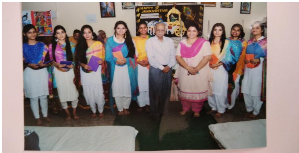
Students receiving a token of appreciation in Arya Samaj Sector 16, Chandigarh.