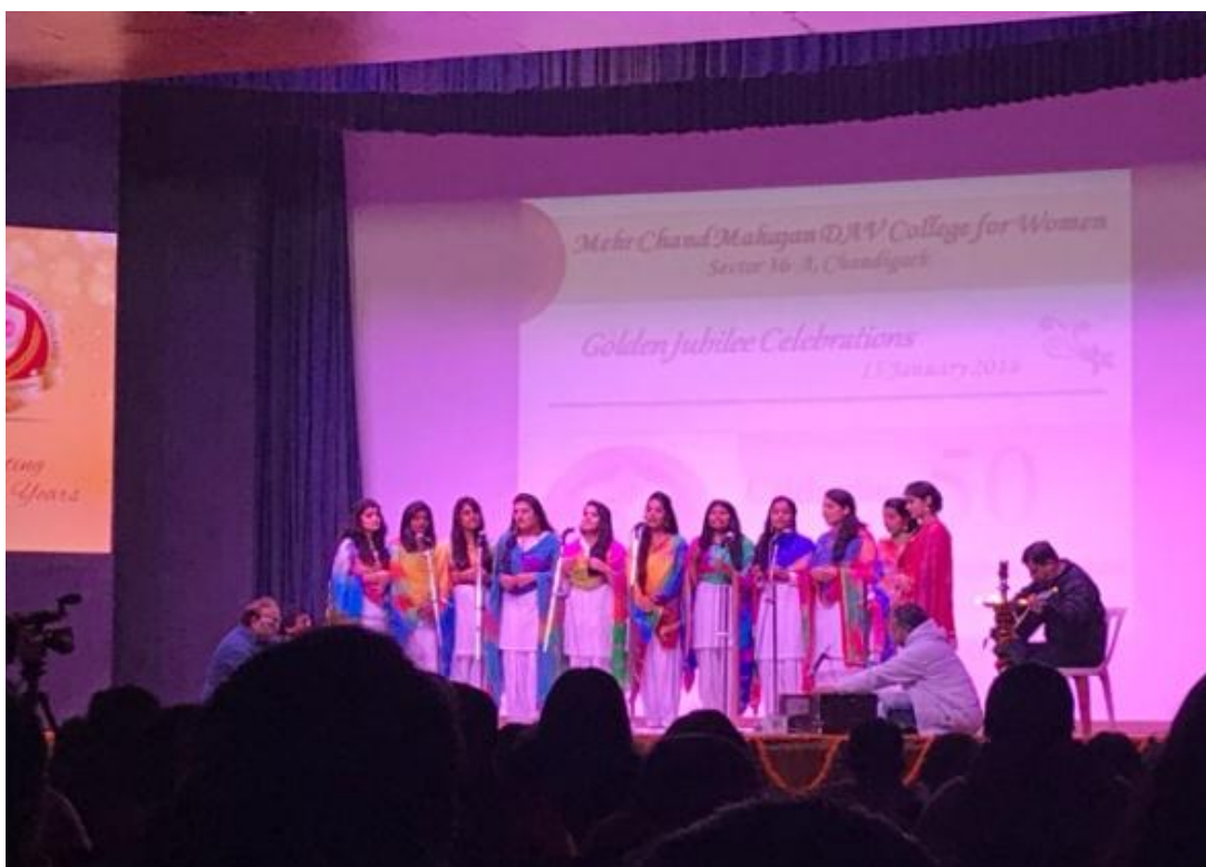
Music vocal department students performing MCM Anthem.