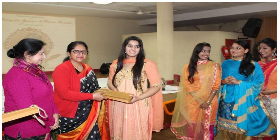
Students receiving token of appreciation by the Principal.