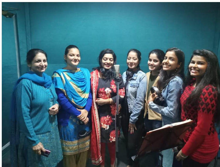
Studio Recording of Swachta song.