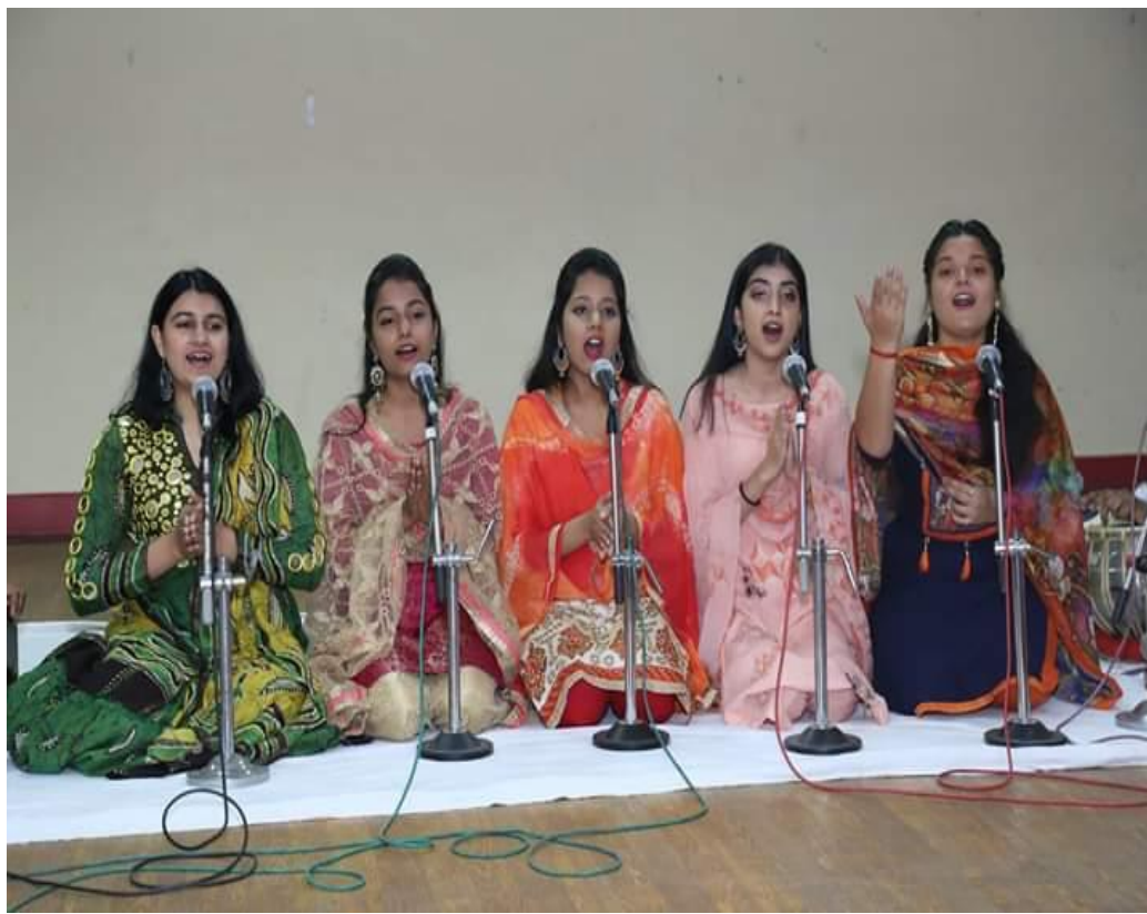
Performing in PTA meet