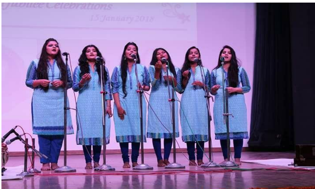
Music vocal department students performing Group Song.