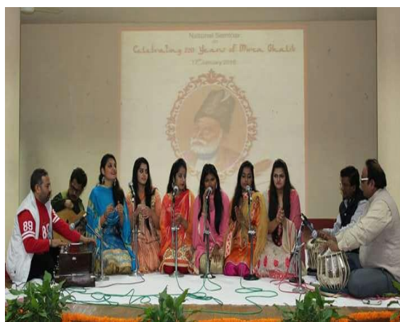
Music vocal department students performing ghazals at Mirza Ghalib Seminar.