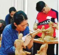
आयोजित एकदिवसीय कला प्रदर्शनकार्य सैक्टर-42 युवा युवा फेस्ट में विभिन्न स्पर्धाओं में भाग लेती छात्राएं।

चौथे दिन, 24 विद्यार्थी (विद्यार्थी) सैक्टर-42 के आयोजित एकदिवसीय कला प्रदर्शनकार्य में भाग लेती छात्राएं। कला प्रदर्शनकार्य में भाग लेती छात्राएं। कला प्रदर्शनकार्य में भाग लेती छात्राएं। कला प्रदर्शनकार्य में भाग लेती छात्राएं। कला प्रदर्शनकार्य में भाग लेती छात्राएं।