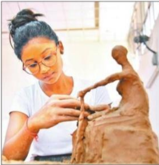
बले मॉडलिंग प्रतियोगिता में भाग लेती एक छात्रा।