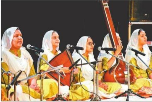
जीसीजी-42 में यूथ फेस्ट के दौरान गुबानी कंपनीशन में भाग लेती स्टूडेंट्स।