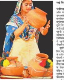
पारंदा के दौरान एक छात्रा द्वारा प्रस्तुत किया गया पारंदा।