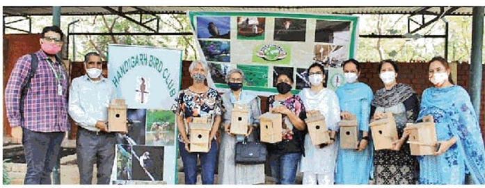
एमसीएम डीएवी कॉलेज फॉर वूमन सेक्टर-36 में गौरैया दिवस पर कॉलेज स्टाफ ने कॉलेज स्टाफ ने कृत्रिम घोंसले लगाए • खत