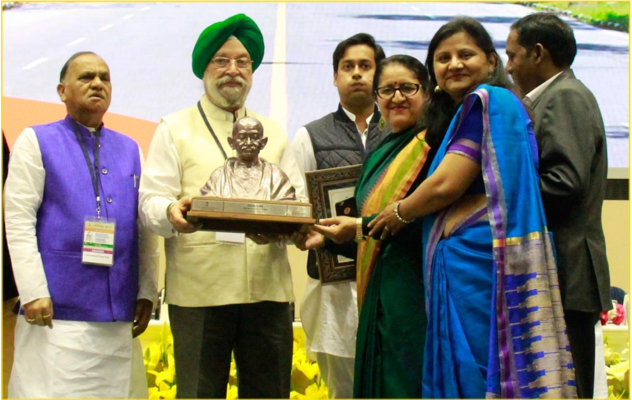
Awarded All-India third rank in the 'Best Citizen-Led Innovations' category during the SwachhSurvekshan Awards-2019 by MHUA, Govt. of India.