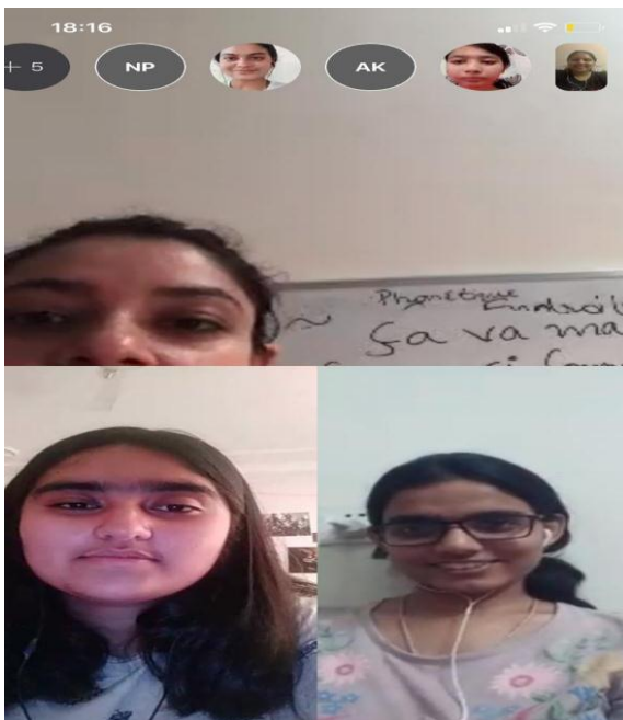
Figure 1 First Day 14th June 2020

The First day aimed at the various accents of French language and the phonetic signs and sounds and their usage.