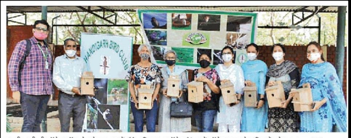
एमसीएम डीएवी कॉलेज फॉर वूमेन सेक्टर–36 में गौरैया दिवस पर कॉलेज कैंपस में कॉलेज स्टाफ ने कृतिम घोंसले लगाए 🍨 खत:

जासं, तंडीगढ़ : एमसीएम डीएवी कॉलेज फॉर वमेन सेक्टर-36 के डिपार्टमेंट ऑफ जूलॉजी एवं ईको क्लब ने चंडीगढ़ बर्ड क्लब (सीबीसी) के सहयोग से विश्व गौरैया दिवस का आयोजन किया। इसमें गौरैया पर एक ऑनलाइन कार्यशाला आयोजित की गई तथा कॉलेज परिसर में पक्षी के घोंसले के बाक्स भी स्थापित किए गए।