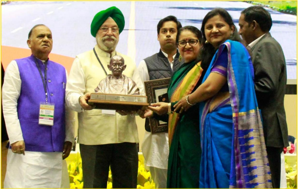
Awarded All-India third rank in the 'Best Citizen-Led Innovations' category during the SwachhSurvekshan Awards-2019 by MHUA, Govt. of India.