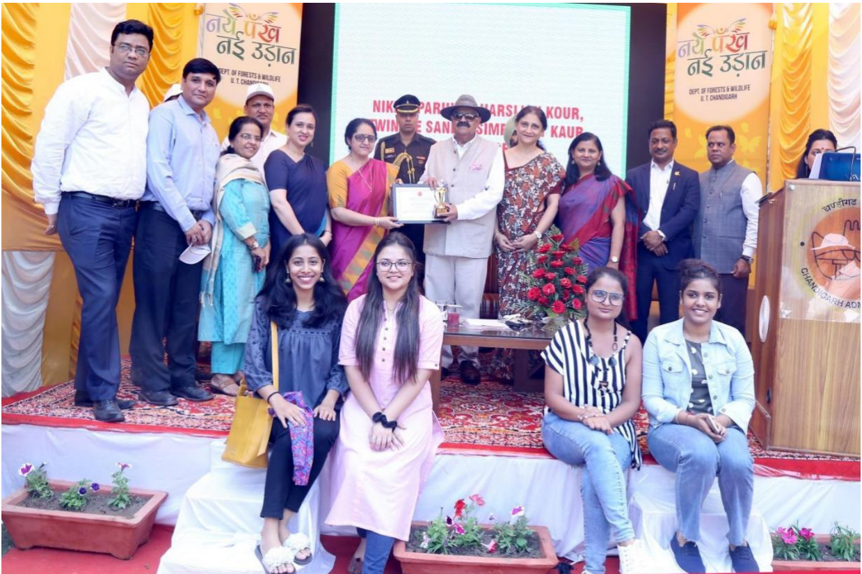
Awarded for video on Single use Plastic Ban in Chandigarh by Hon'ble Administrator of UT Chandigarh and Governor of Punjab Sh. V.P. Singh Badnore.