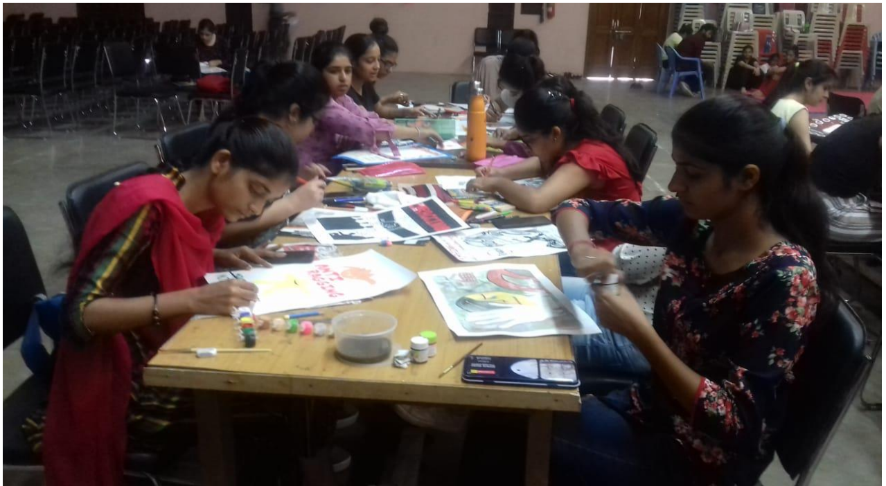
Young artists at work in a Poster Making Contest on 'Menace of Ragging'