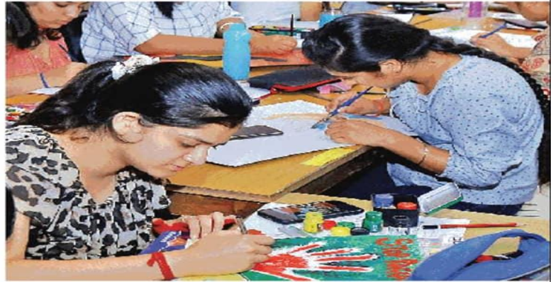
चंडीगढ़ : एमसीएम डीएवी-36 में पोस्टर बनाकर एंटी रैगिंग का संदेश देते स्टूडेंट्स

एमसीएम डीएवी-36 के स्टूडेंट्स ने एंटी रैगिंग का संदेश देने के लिए पोस्टर मेकिंग प्रतियोगिता का आयोजन किया। इसमें रैगिंग के खिलाफ आवाज उठाई गई।