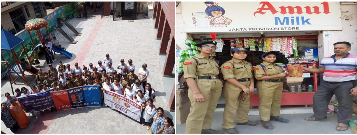
PLASTIC BAN CAMPAIGN