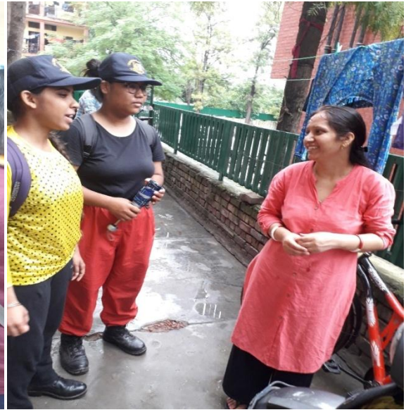
SBSI PROGRAM 2019