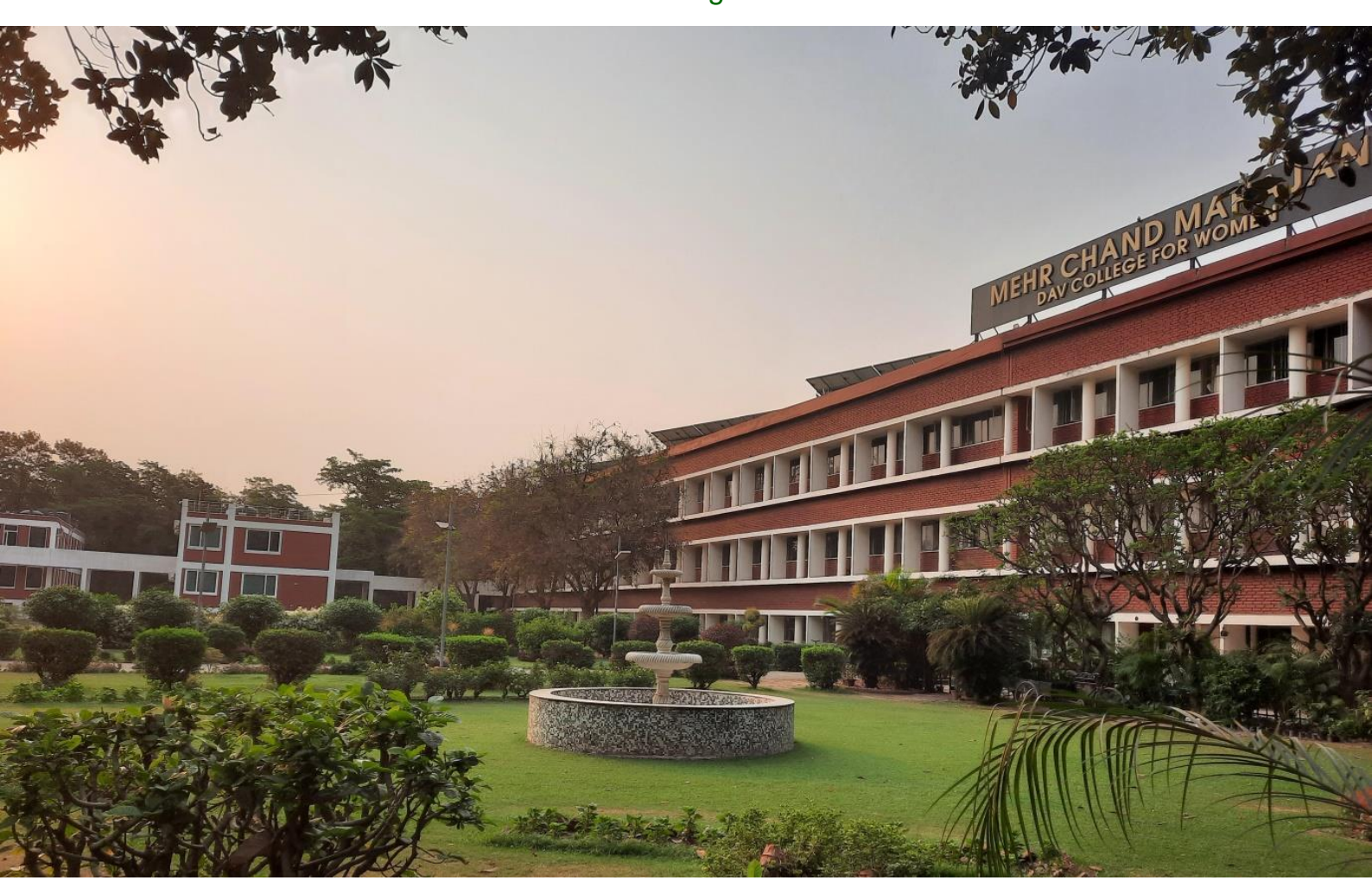
Use of Tertiary Water for maintenance of sports ground & Lawns in the college campus.