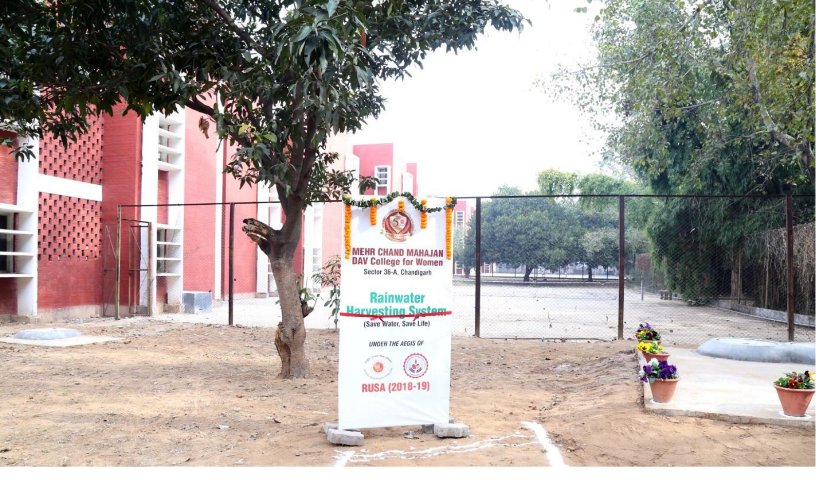
Rainwater Harvesting System