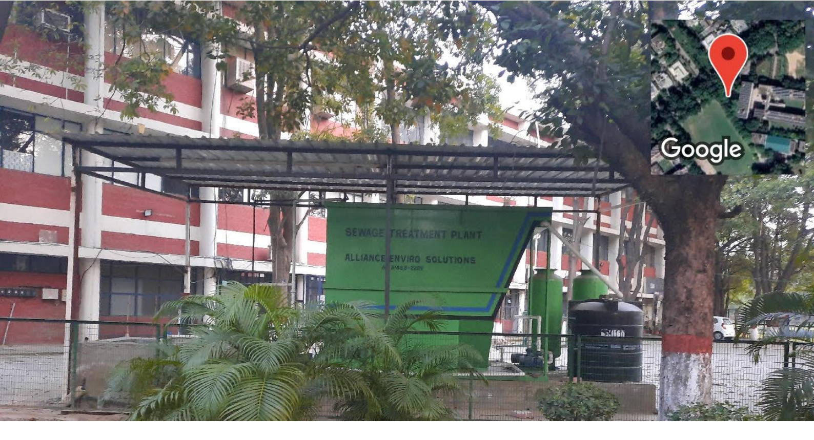
Sewage Treatment Plant