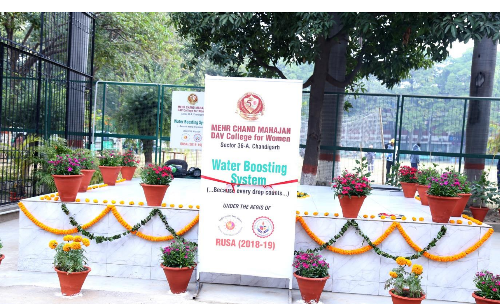
Water Boosting System