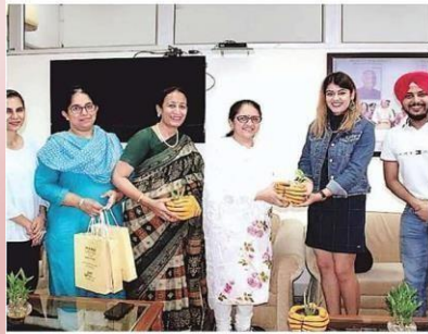
DP CORRESPONDENT Chandigarh

Under the aegis of the Placement Cell of MCM DAV College for Women, Tommy Hilfliger and Calvin Klein during a recruitment drive at the campus on Monday. The premium designer lifestyle group conducted the drive to select suit-