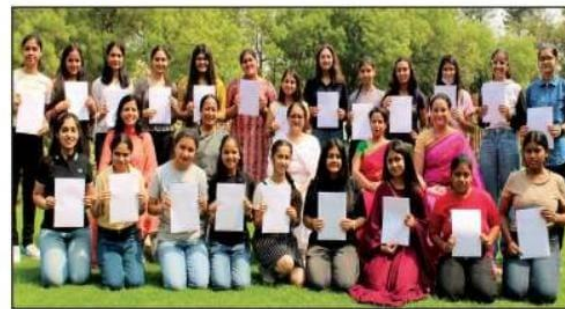
प्लेसमेंट ड्राइव के दौरान चुनी गई एमसीएम कॉलेज की छात्राएं।

छात्राओं का चयन किया गया। बुल्स आई नॉलेज सिस्टम प्राइवेट लिमिटेड (हिट बुल्स आई) में काउंसलर के