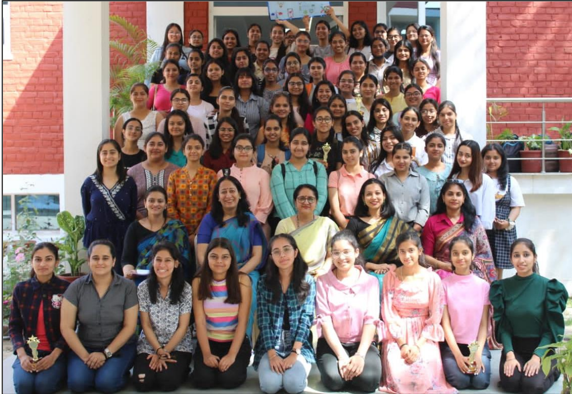
Pride Classroom, National Institute of Security Markets NISM - Employment Enhancement Program (2021-22), Regional Centre for Entrepreneurship Development, The National Association of Software & Services Companies , GOOGLE and Chandigarh Municipal Corporation.