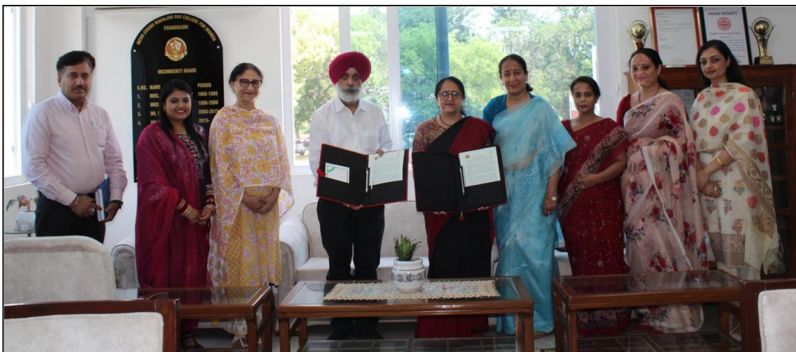
In order to strive for synergic effect, Memorandum of Understanding was signed with various organizations with a vision to equip the students with the requisite skills. The MOU signed with Gilco International School aims to cooperate and