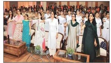
लाइव कार्यक्रम में भाग लेते हुए।

चंडीगढ़, 13 सितंबर : एमसीएम डीएवी कॉलेज फॉर वूमैन सेंक्टर 36 के विक्टरी अगेनस्ट ड्रग अब्यूज क्लब ने कॉलेज के एनसीसी नेवल विंग और आर्मी विंग के सहयोग से अधिकारिता मंत्रालय में लाइव स्ट्रीमिंग के माध्यम से भाग लिया। नशा मुक्त भारत अभियान