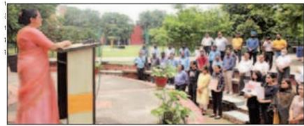
CHANDIGARH: Mehr Chand Mahajan DAV College for Women, Chandigarh organized a Pledge ceremony...