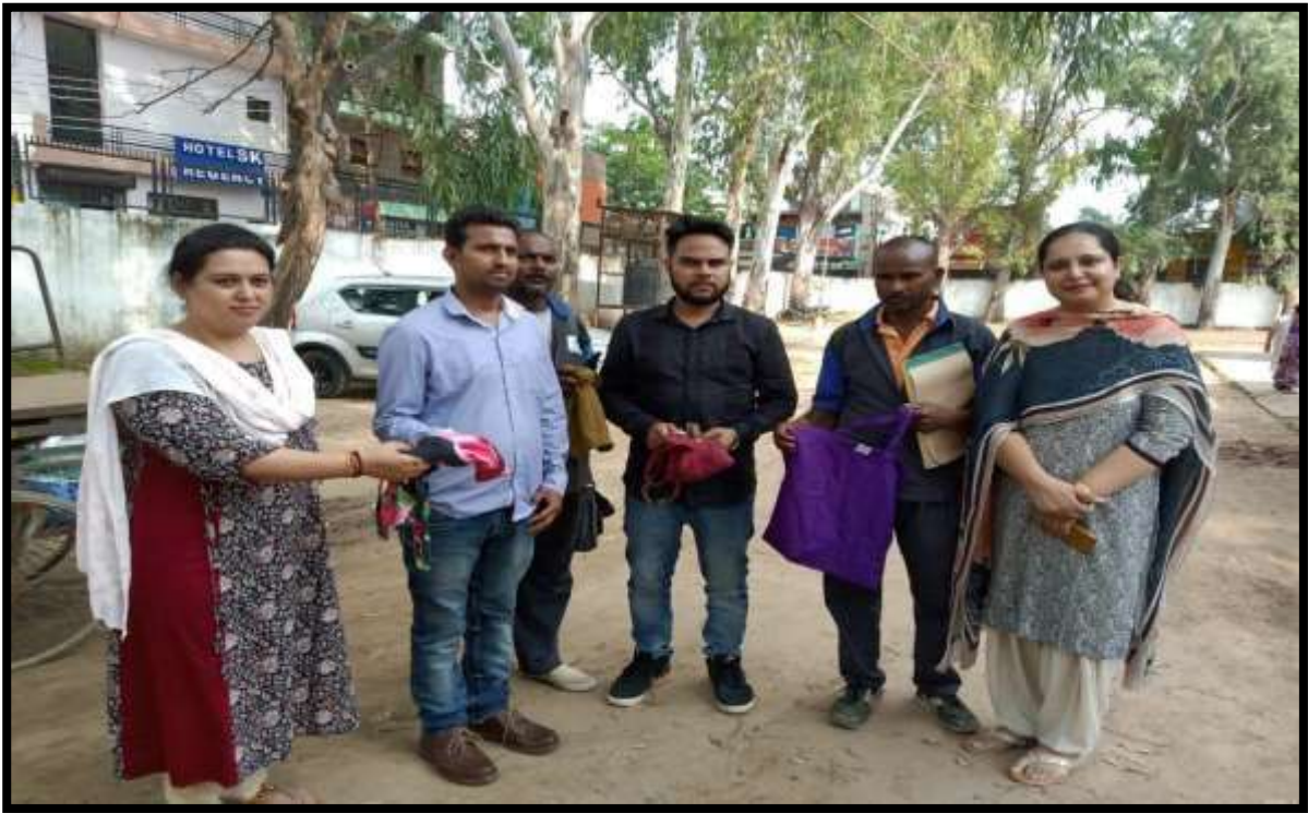
Distribution of Cloth Bags to Municipal Corporation Officials