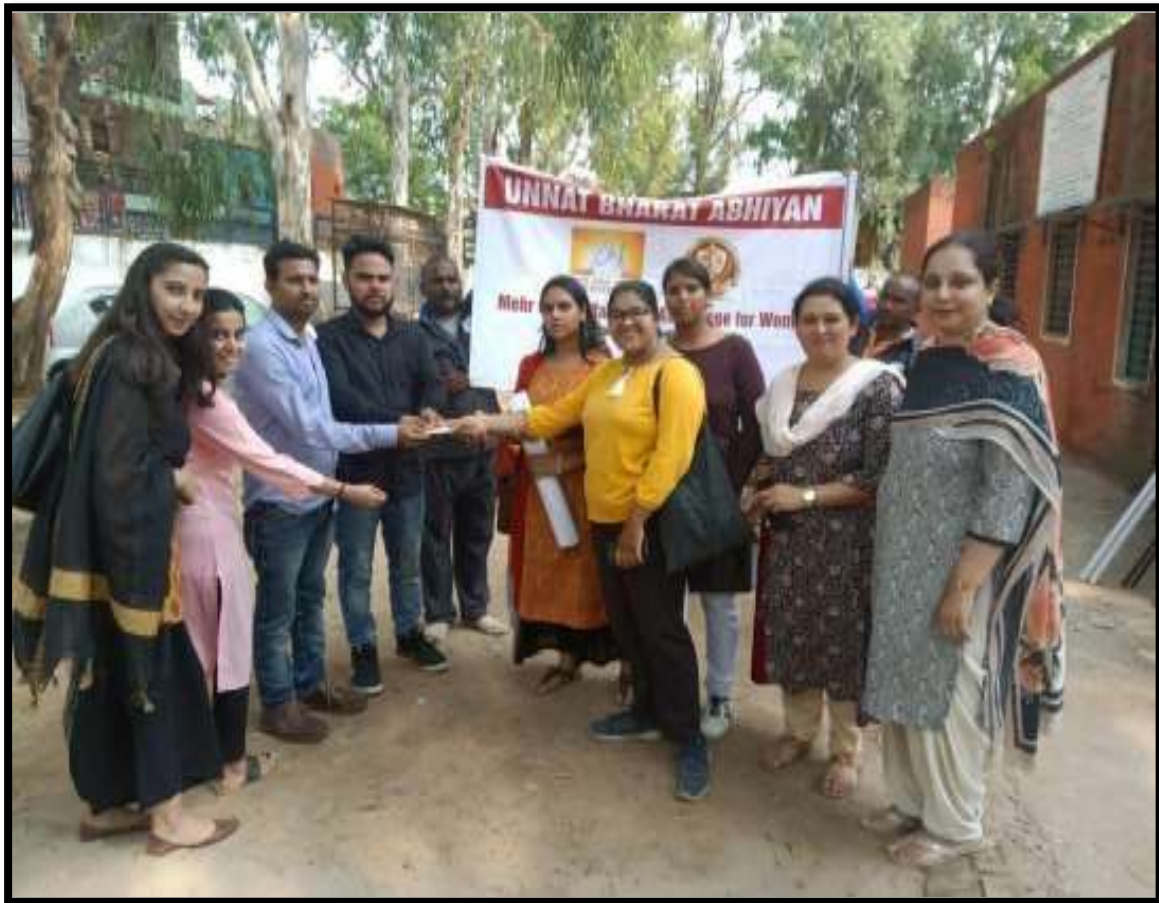
Collected Cash Handed over to Municipal Corporation Officials after Selling Plastic