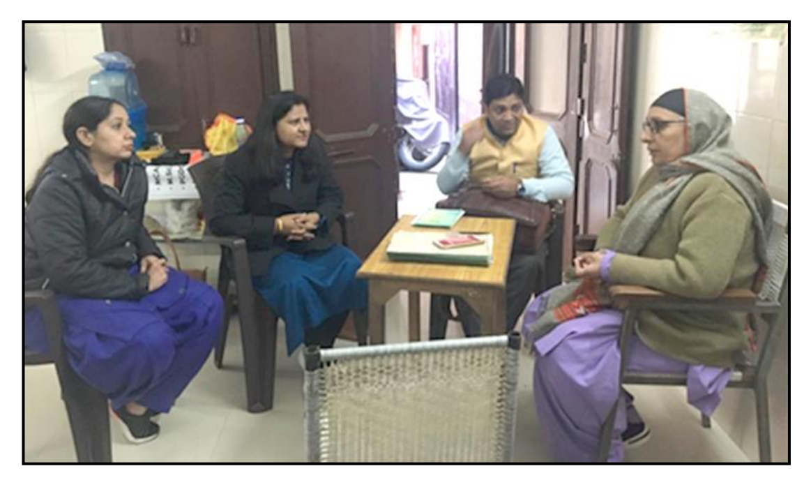
Report on Open Defecation Free (ODF) Drive at Badheri and Buterla VillageMehr Chand Mahajan DAV College for Women, ChandigarhPage No.: 2

With this aim, MHRD along with Mehr Chand Mahajan College DAV College for Women, Chandigarh have collaborated to promote Swachh Bharat Mission (Gramin) mission [SBM-G] for achieving ODF status for its two adopted villages – Badheri and Butrela through a pilot level Swachhta Action Plan (SAP).