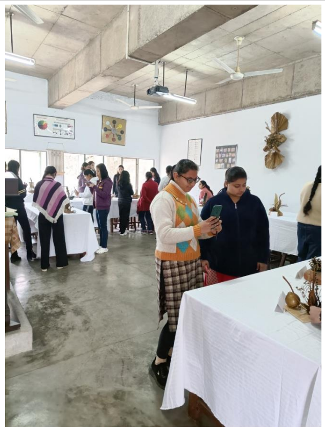
Students working on their work of art