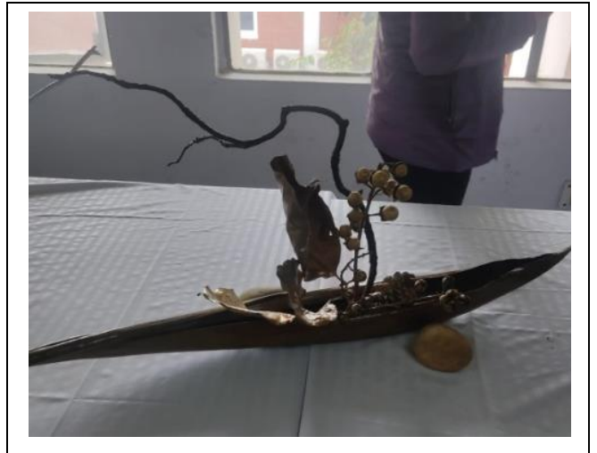
Student's creative work on display