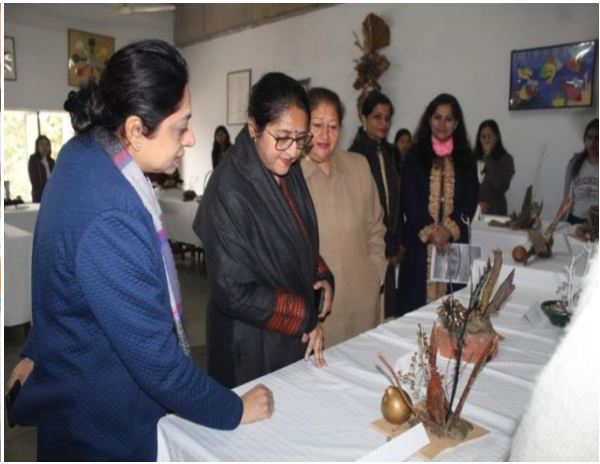
Worthy Principal Madam admiring the art pieces