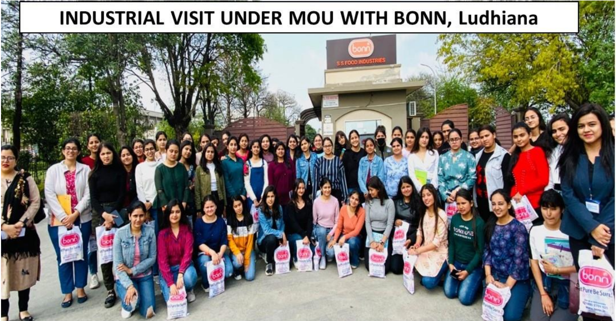
Bonn Nutrients Private Limited, Ludhiana (12th March, 2020)