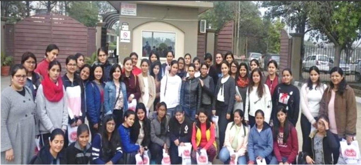
Bonn Nutrients Private Limited, Ludhiana (16th February, 2019)