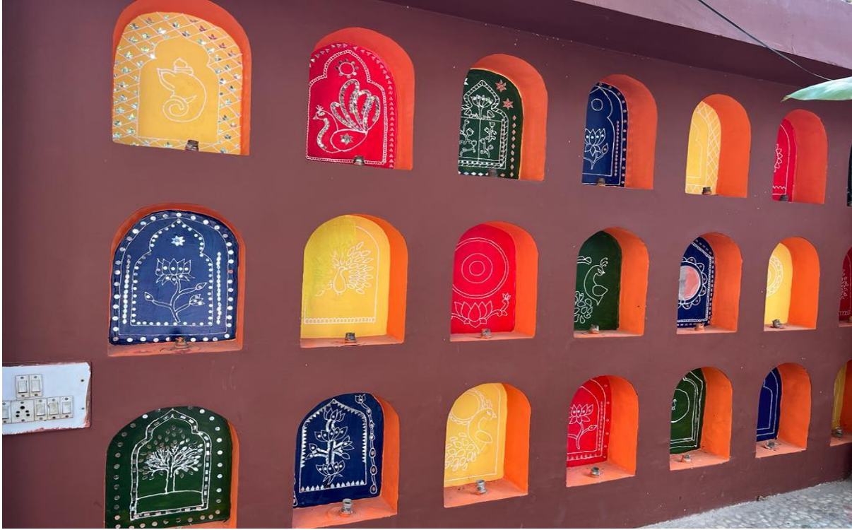
5. Decoration was done for the Youth festival