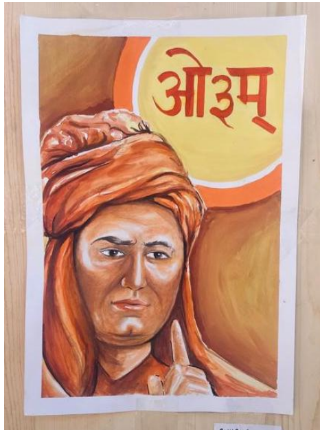
3 rd Prize