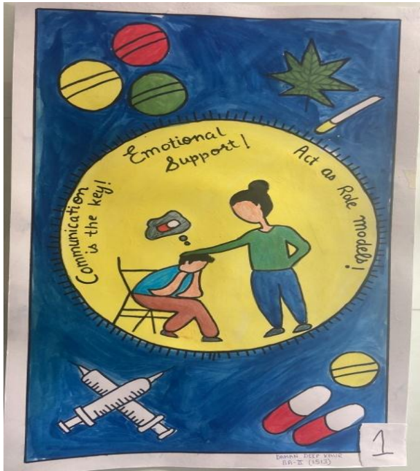
3 rd Prize