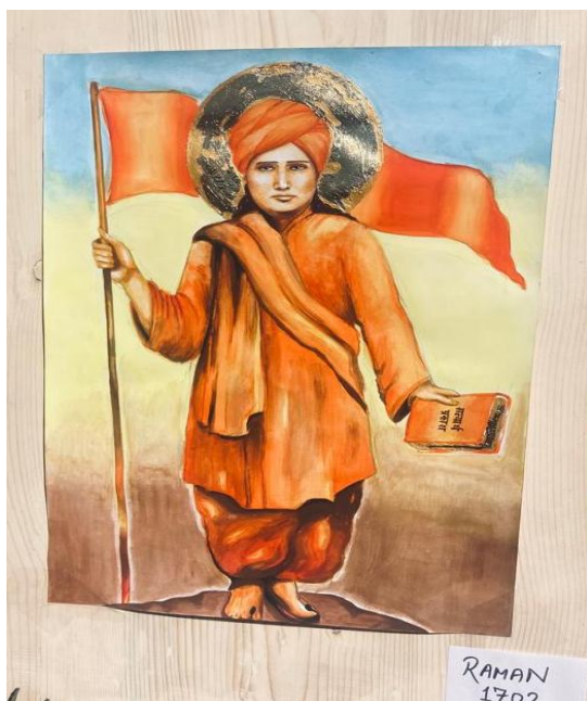
2 nd Prize