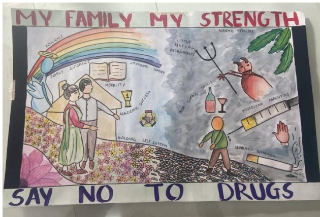
2 nd Prize