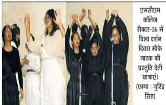
एमसीएम कॉलेज सैक्टर-36 में विश्व दर्शन दिवस मौके नाटक की प्रस्तुति देती छात्राएं।