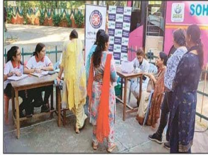
कैंप में कैंसर के प्रति जानकारी लेते हुए।