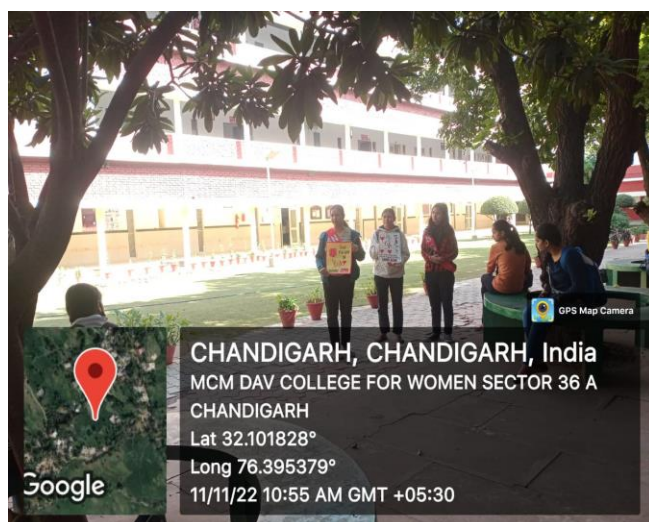
CHANDIGARH, CHANDIGARH, India MCM DAV COLLEGE FOR WOMEN SECTOR 36 A CHANDIGARH Lat 32.101828° Long 76.395379° 11/11/22 10:55 AM GMT +05:30