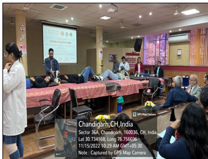
Chandigarh, CH, India Sector 36A, Chandigarh, 160036, CH, India Lat 30.734168, Long 76.756696 11/15/2022 10:29 AM GMT+05:30