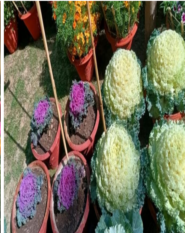
Flowers plants displayed for exhibition at the 52 nd Rose Festival 2024