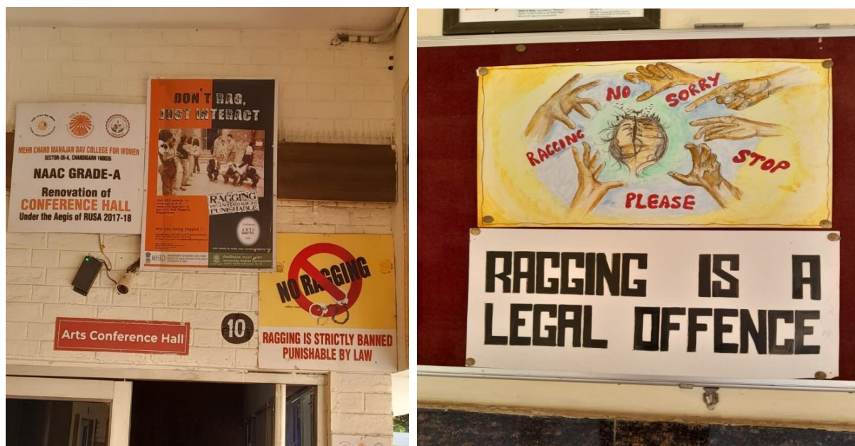
Posters warning against Ragging on display at various spots in the College