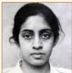
LATE FLIGHT LT. HARITA KAUR DEOL One of the first seven women cadets inducted into the Air Force as pilot (SSC) and first to fly solo in the Indian Air Force