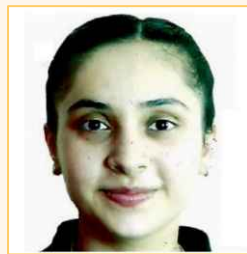
Sanya International Fencer