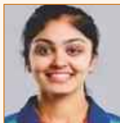
HARLEEN KAUR DEOL Indian Cricketer