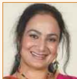
SATWINDER BITTI Punjabi Singer