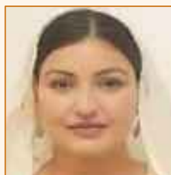
ANMOL GAGAN MAAN Punjab Cabinet Minister