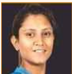
TANIYA BHATIA Indian Cricketer