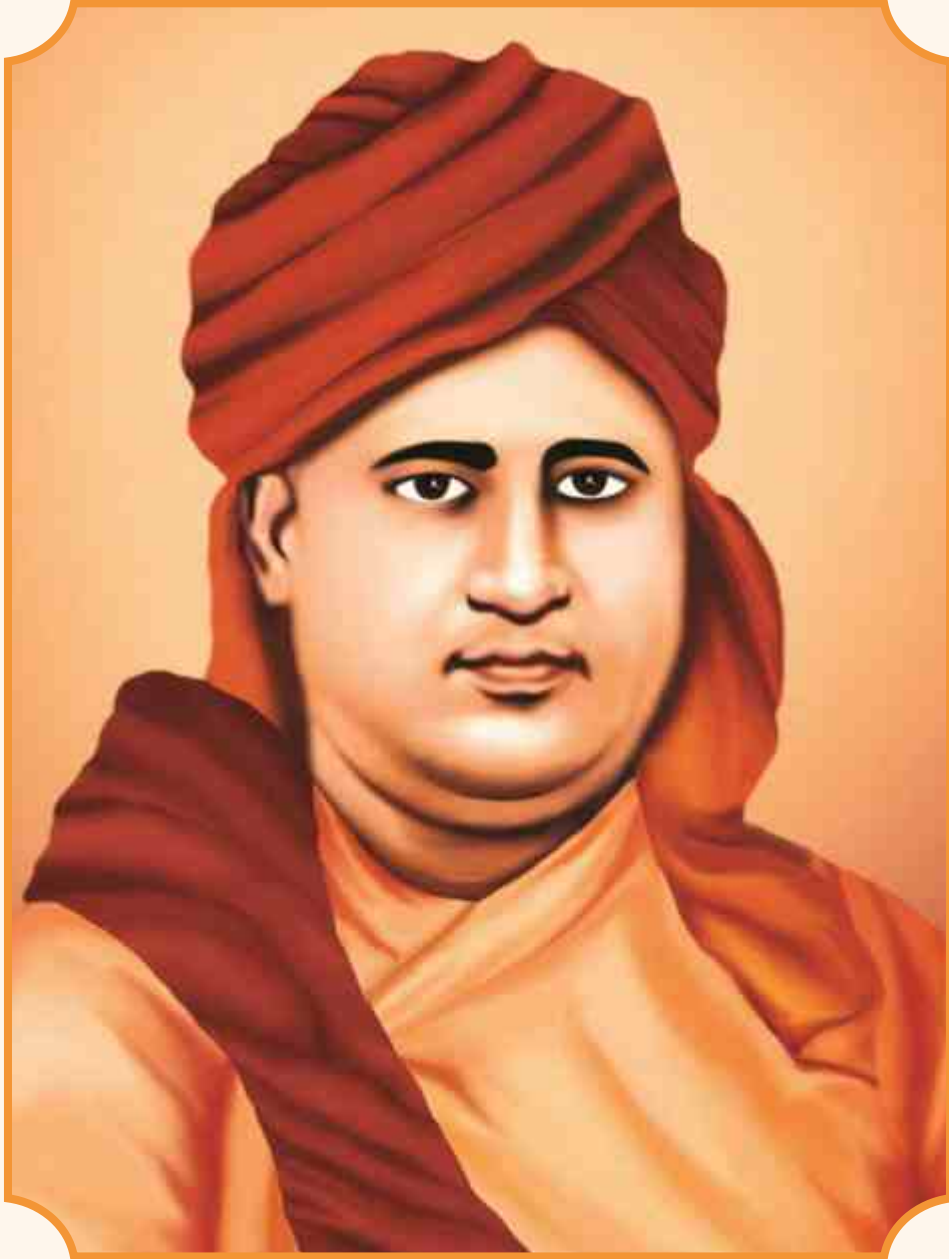
MAHARISHI SWAMI DAYANAND SARASWATI