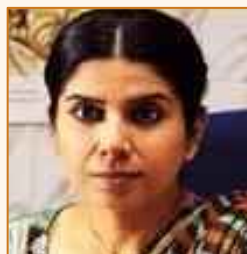
MITA VASHISHT Actress & Theater Personality